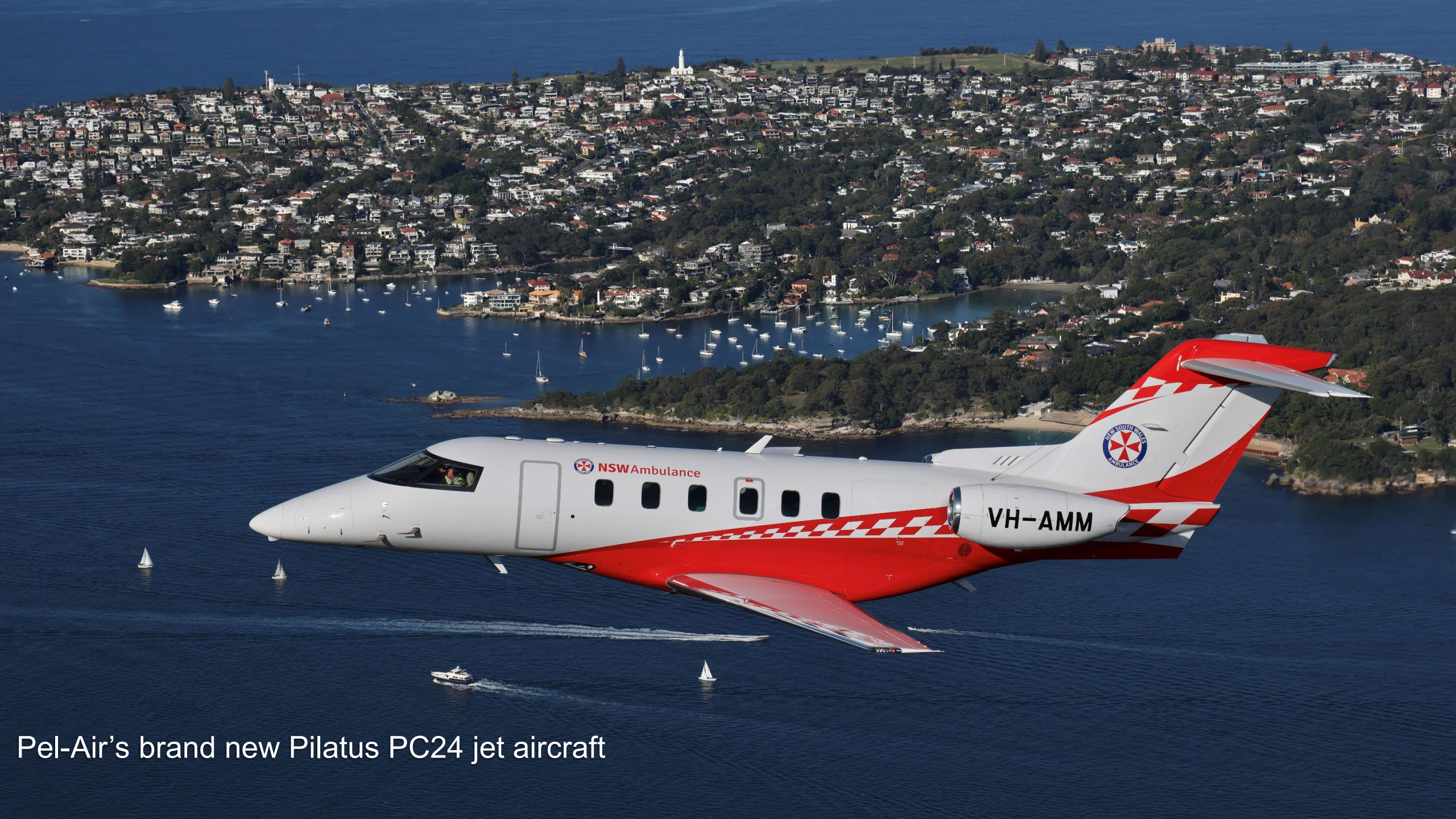
Pel-Air's brand new Pilatus PC24 jet aircraft