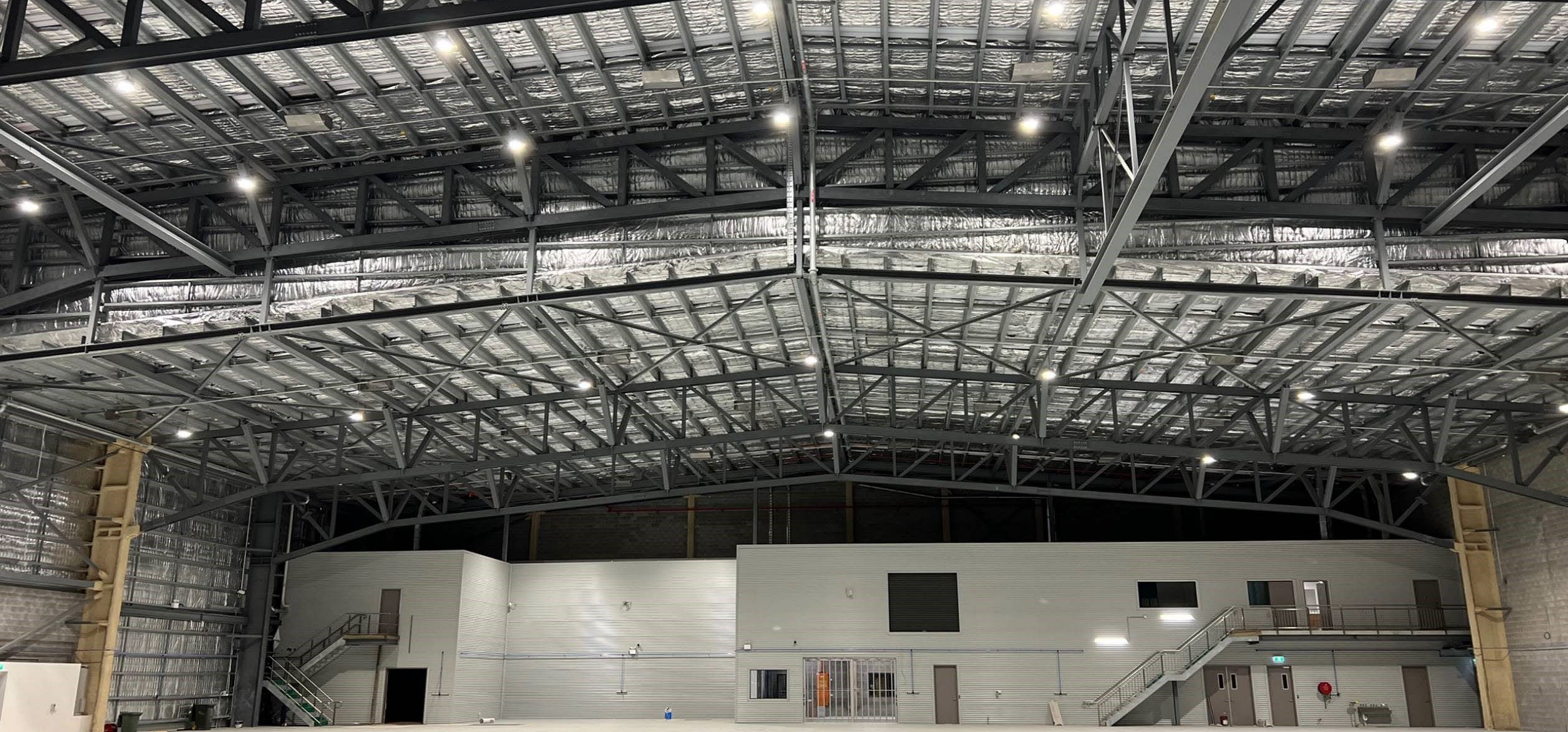
Construction of Rex's new Sydney Hangar nearing completion Aug 2023